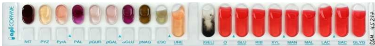
Abbildung 1: Apicoryne-Teststreifen mit Keim DSM 45277.