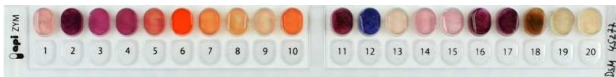
Abbildung 2: Apizym-Teststreifen mit Keim DSM 45277.